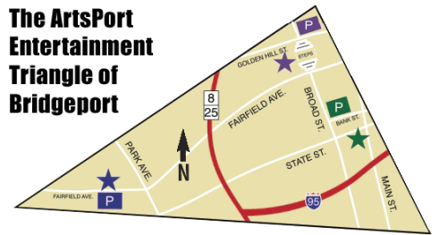
The ArtsPort Entertainment Triangle of Bridgeport